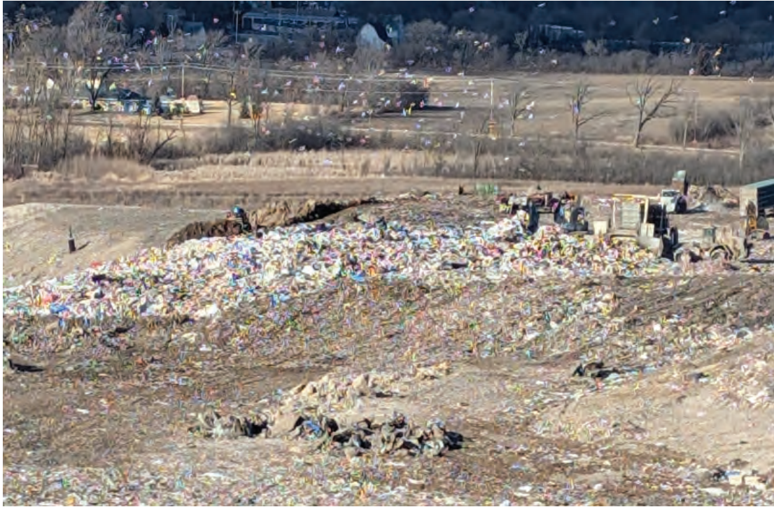
Working face extended into West slope at North end of Phase 7