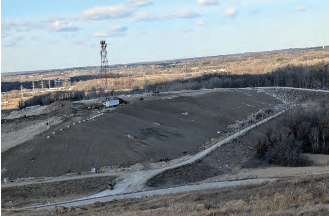
Phase 1, East slope of North Expansion West