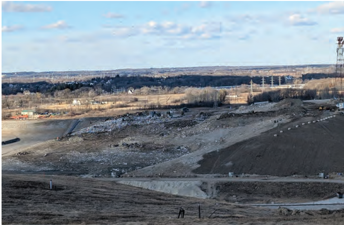
Overview of North Expansion West