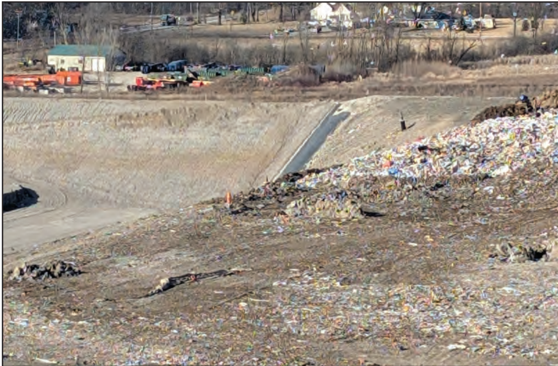
West edge of working face in Phase 3