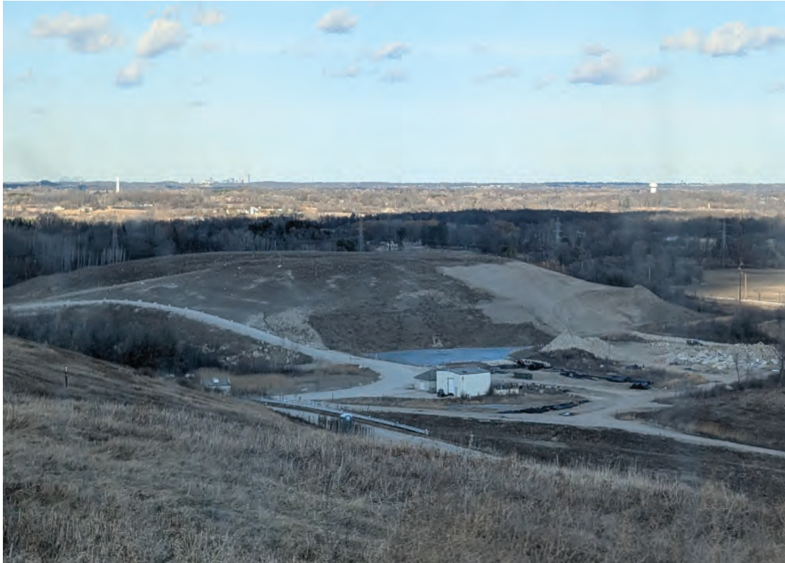
Stock pile, moatly vegetated