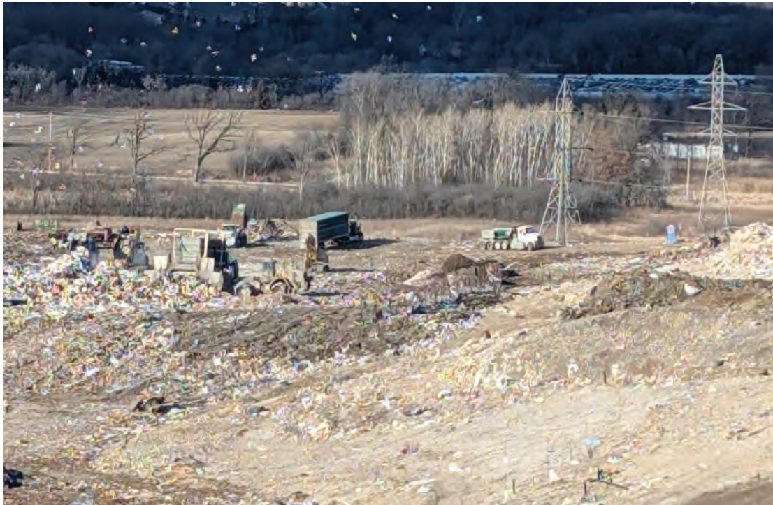
Working face at North end of Phase 3